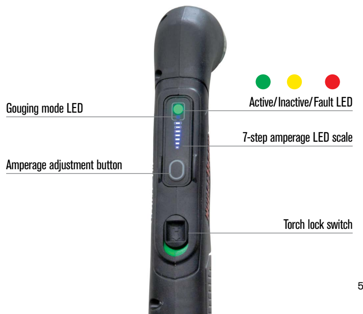
Gouging mode LED

New color-coded, quarter-turn cartridges can be changed out in about 10 seconds!