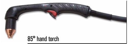
85° hand torch

Duramax Hyamp standard torch styles (for more torch options, see www.hypertherm.com )